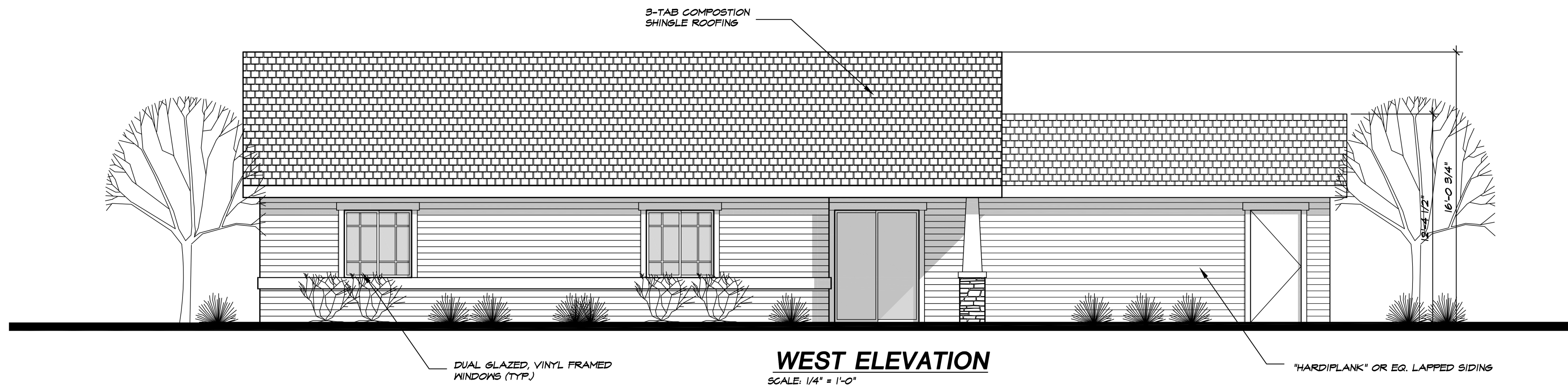
WEST ELEVATION SCALE: 1/4" = 1'-0"

PETERS • JEPSON PARTNERSHIP, INC. 413 SOUTH GLASSSELL ORANGE, CALIFORNIA 92866 (714) 288-8700