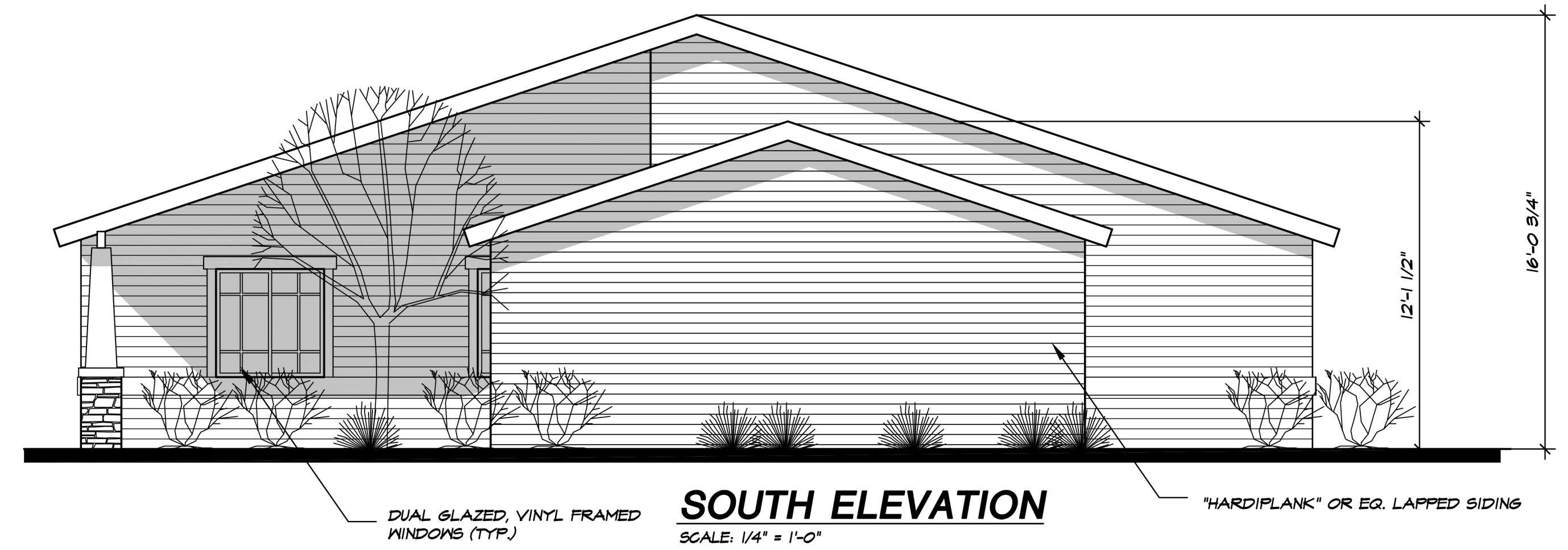
SOUTH ELEVATION SCALE: 1/4" = 1'-0"